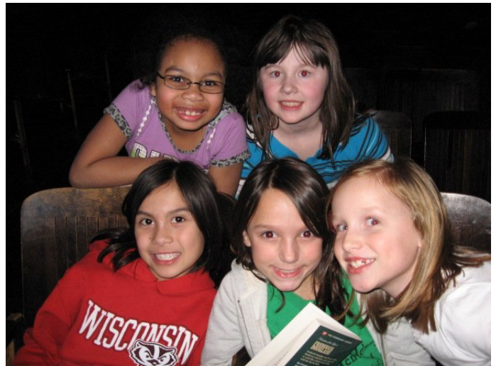
Hartford 3rd graders enjoy the free books they received