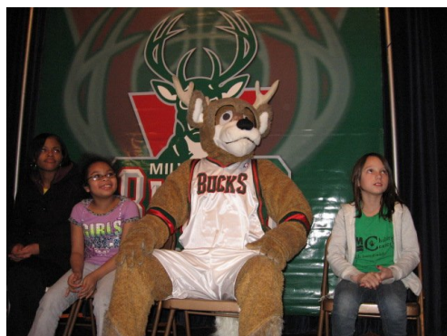
Hartford students battling Bango in the trivia quiz