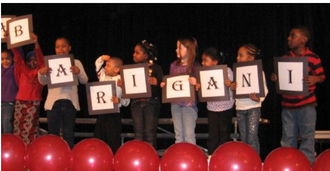
First graders spelling Habari Gani, Swahili for "what's new?"